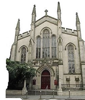
St Andrew’s Cathedral (1836)