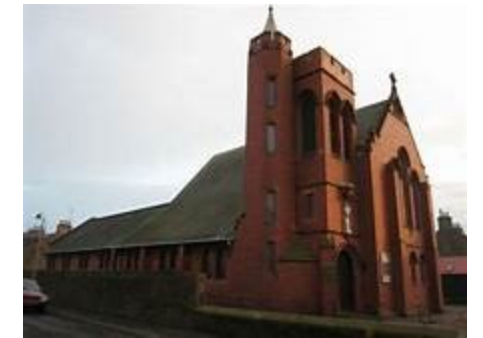
Our Lady of Good Counsel (1904)