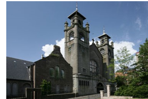
St Mary Our Lady of Victories (1851)