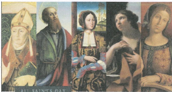
ALL SAINTS DAY

Join us for a sung mass to honour all saints.