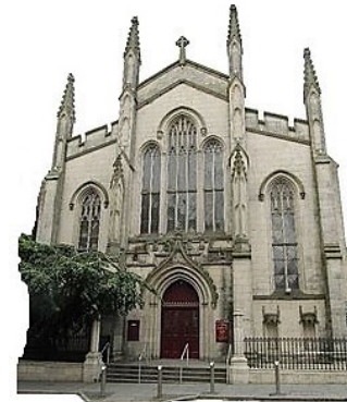
St Andrew's Cathedral (1836)

Welcome to St Andrew's Cathedral, St Mary, Our Lady of Victories, Forebank, and Our Lady of Good Counsel, Broughty Ferry