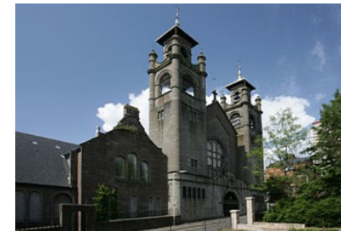
St Mary, Our Lady of Victories (1851)