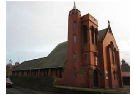
Our Lady of Good Counsel (1904)

30th Sunday in Ordinary Time 23 October 2022 - Year of Luke - C Next Sunday: 31st Sunday of Ordinary Time