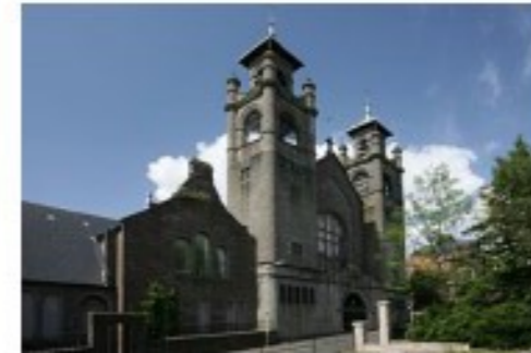
St Mary, Our Lady of Victories (1851)