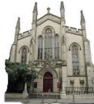
St Andrew’s Cathedral (1836)

Welcome to St. Andrew’s Cathedral, Our Lady of Good Counsel, Broughty Ferry and St Mary, Our Lady of Victories, Forebank