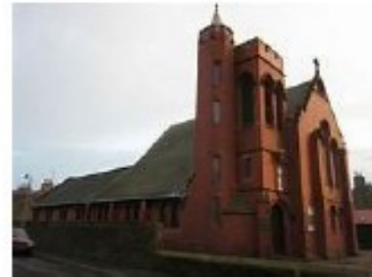
Our Lady of Good Counsel (1904)