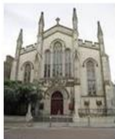
St Andrew's Cathedral