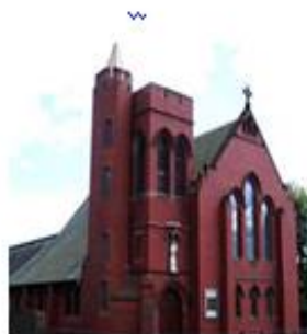
Our Lady of Good Counsel

Sunday 6 December 2020 Second Sunday of Advent Next Sunday: Third Sunday of Advent Year of Mark