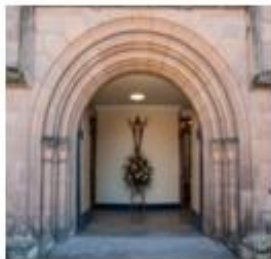
St Thomas', Arbroath