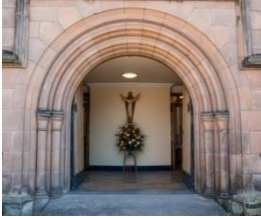
St Thomas', Arbroath