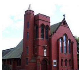
Our Lady of Good Counsel

Sunday 20 December 2020 Fourth Sunday of Advent Next Sunday: Feast of the Holy Family Year of Mark