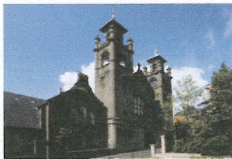
St Mary, Our Lady of Victories (1851)