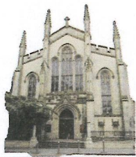
St Andrew's Cathedral (1836)