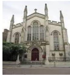
St Andrew's Cathedral