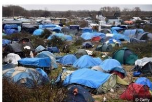
Migrant camps in Calais, France.