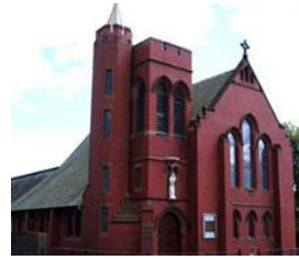
Our Lady of Good Counsel

Sunday 22 November 2020 Solemnity of Jesus Christ King of the Universe