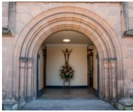
St Thomas', Arbroath