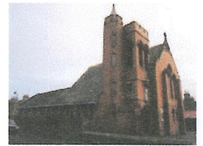
St Andrew's Cathedral (1836)